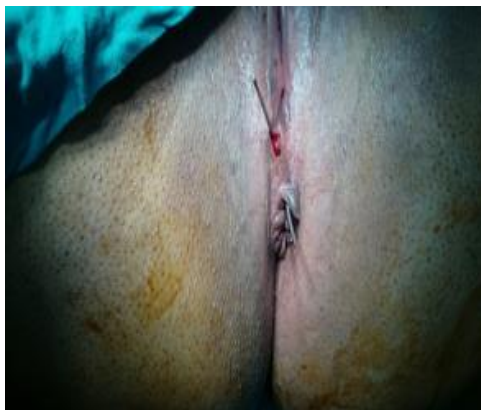
Figure (1): Fistulotomy

In the fistulotomy with marsupialization (figure 2), the fistula tract was laid open over the probe placed in the tract. After the fistula tract had been laid open, the tract was curetted and examined for secondary extensions. Wound edges were sutured with the edge of fistula tract by using interrupted 3-0 vicryl sutures.